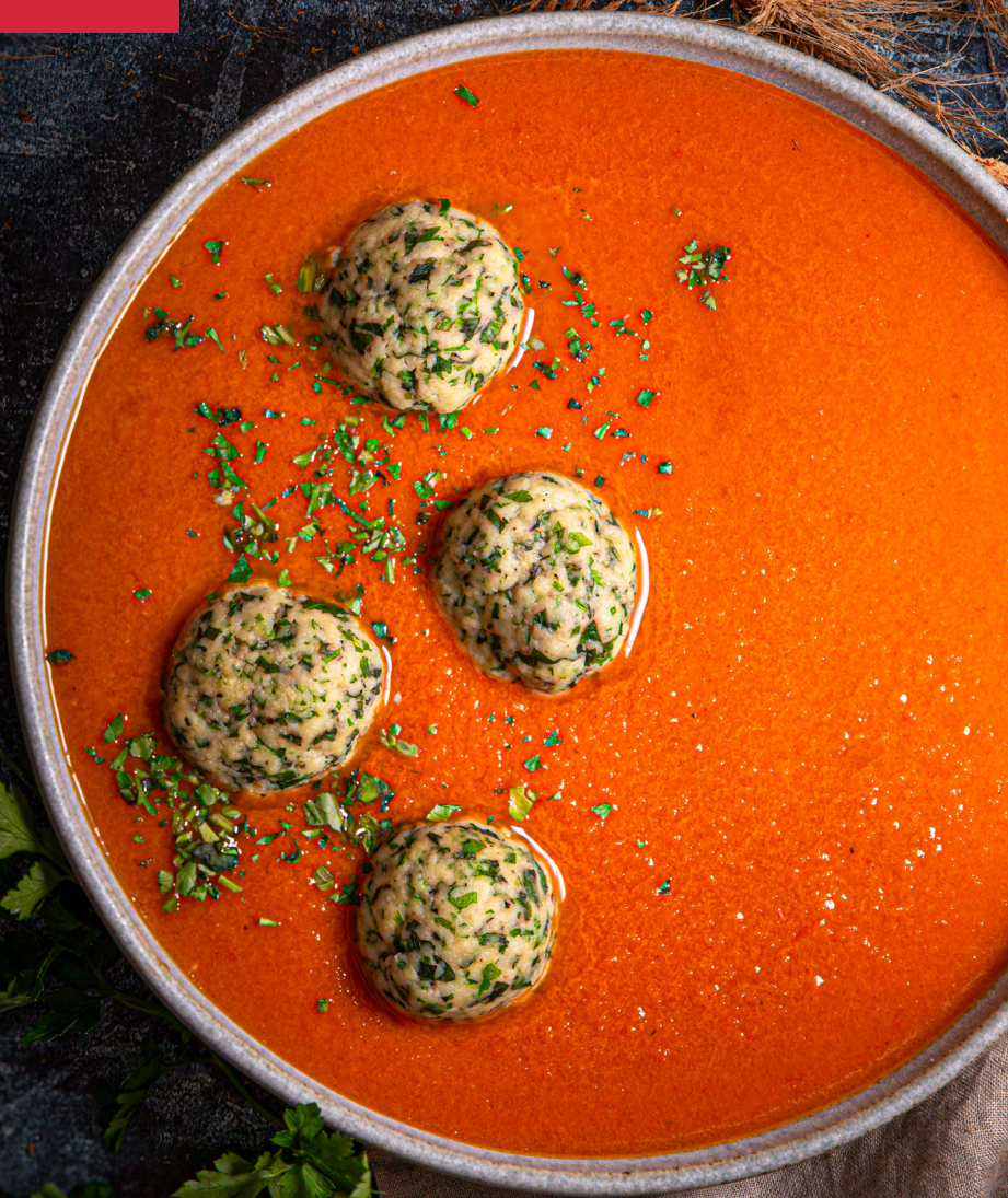
Roasted Tomato & Basil Soup with Herby 'Frog' Kneidlach